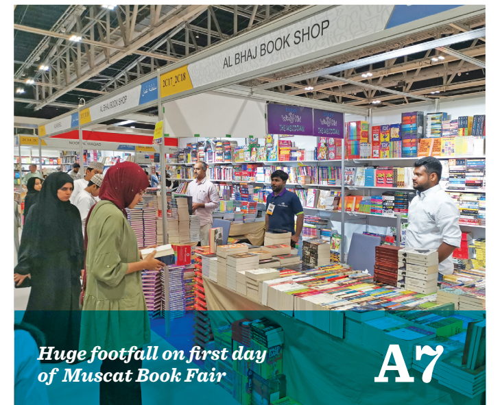
Huge footfall on first day of Muscat Book Fair

"Furthermore, we are looking to expand our flights to more international destinations, including the Indian sub-continent. The operation of these flights will all depend on the approvals that we get from different authorities, and the support that we get from the local stakeholders here," Ahmed said. >A8