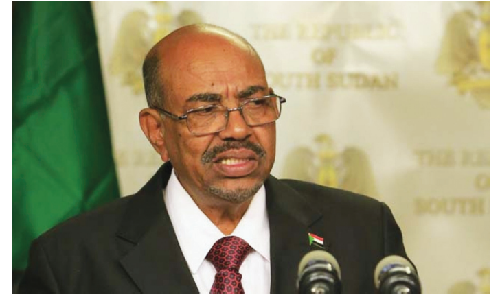
Omar Al Bashir

Sudanese President Omar Al Bashir said the 'demands of our people for better living conditions are lawful'