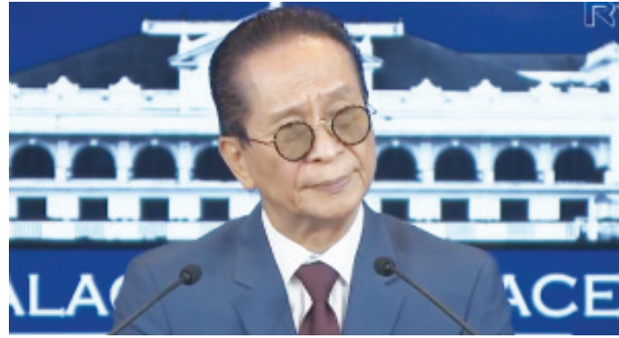
REMAIN FOCUSED: Presidential Spokesperson Salvador Panelo reacting to criticisms regarding the government's massive 'Build, Build, Build' infrastructure programme and war on drugs.

Panelo said the 'Build, Build, Build' programme already kicked-off after delays due to "bureau-