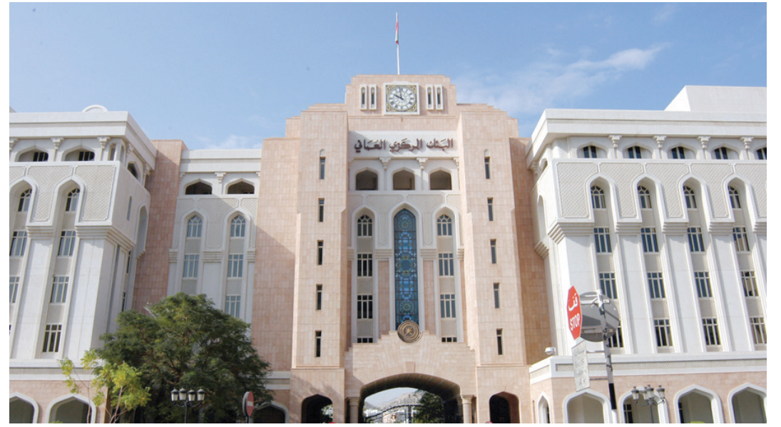
Central Bank of Oman.

The combined balance sheet of conventional and Islamic banks (other depository corporations) taken together provides a complete overview of the financial