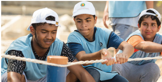
HAND IN HAND: Students from the Oman Academy for Special Skills attending the outdoor activities programme.