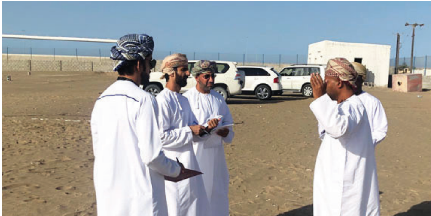
SUPPORTING THE YOUTH: The 2019 Green Sports programme evoked big response as more sports teams have applied seeking support for greening and infrastructure development of football fields.

The 2019 Green Sports programme evoked big response as