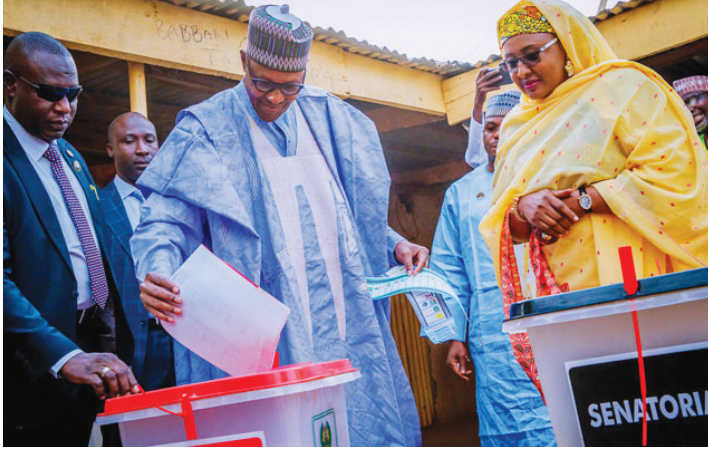
EXERCISING FRANCHISE: President Muhammadu Buhari and wife, Aisha cast their votes at Kofar Baru in Daura his home town.

The election is reported to be a two-horse race between Muhammadu Buhari of the governing All Progressives Congress party and Atiku Abubakar of the main opposition Peoples Democratic Party