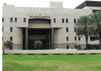
Ministry of Commerce and Industry.

The statistics department of the Ministry of Commerce and Industry said that there were 6,166 construction contractors activities registered, the largest among the other activities.