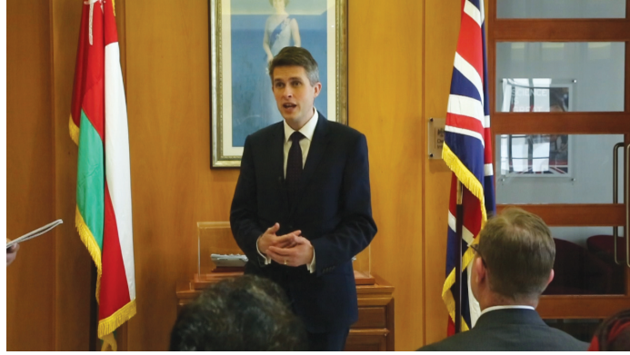
COMMITTED TO PEACE: UK's Secretary of State for Defence Gavin Williamson said Britain has made it clear that its commitment is not just to the security of Oman but to the entire Gulf region.

The comments were made during Williamson's recent visit to the Sultanate, where the UK and Oman both signed the Joint Defence Agreement on