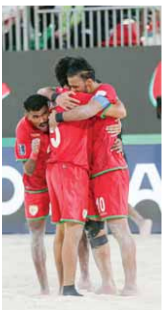
Oman bow out of Beach Soccer World Cup with head held high A7

reached the site, where at least two family members of our colleagues have been killed and six people wounded. We are horrified by what has taken place," MSF said. The strike occurred in Muwasi, a sandy and largely undeveloped strip of coastal land transformed into a sprawling tent camp. G20 ministers meet in Brazil to talk Gaza and UN G20 foreign ministers are meeting in Rio de Janeiro, where they are expected to discuss Israel's war against Hamas in Gaza and the threat of a conflagration in the Middle East. Brazilian President Luiz Ignacio Lula da Silva has criticized the United Nations for failing to resolve the conflict between Israel and the Palestinians. — Agencies